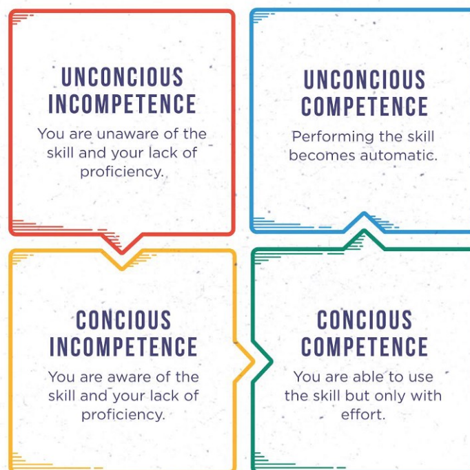
Figure 7.2 Stages of Competence

The journey from unconscious incompetence, through conscious incompetence, followed by conscious competence, and finally unconscious competence, described in Figure 7.2 is one that other students evidenced in their journey of values development and their ability to put